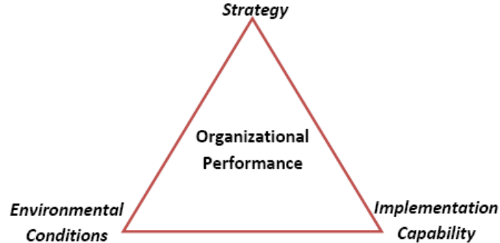
Figure 1. Aligning Determinants of Organizational Performance