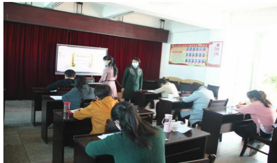
Figure 1. The training and testing of response measures conducted by Lucheng Kindergarten

Pay attention to supporting staff. The Government Kindergarten of Kunming organized online training for canteen staff through a WeChat group, offering sessions that focused on safe food production and management of canteen facilities. The Lucheng Kindergarten of Chuxiong Prefecture conducted training and tests for all staff on the basic knowledge of COVID-19, health risk assessment, epidemic prevention measures, and emergency drills. Many kindergartens organized staff training to strengthen their professional skills as well as their social and emotional well-being.