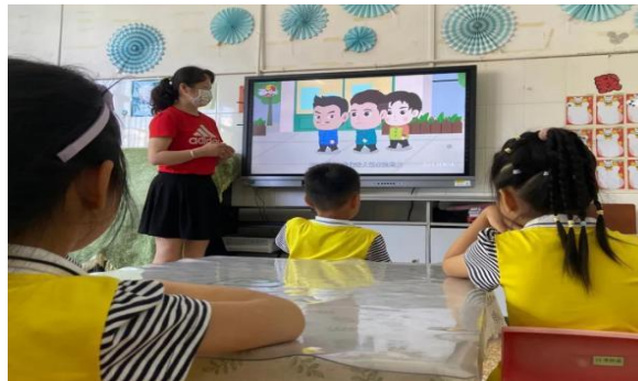
Figure 8. The back-to-school orientation of the government kindergarten in Honghe Prefecture