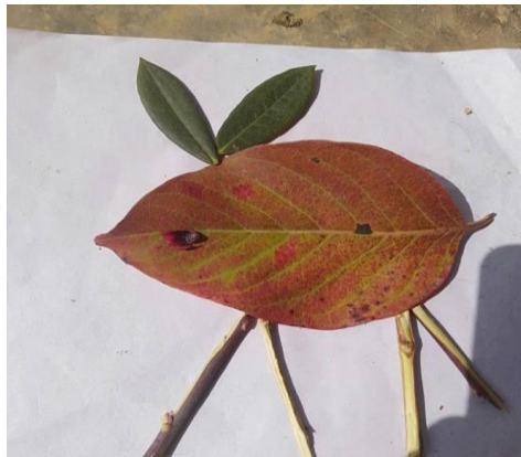
Figure 4. Children and parents from Shiyan Village Kindergarten used leaves and sticks to make animal drawings