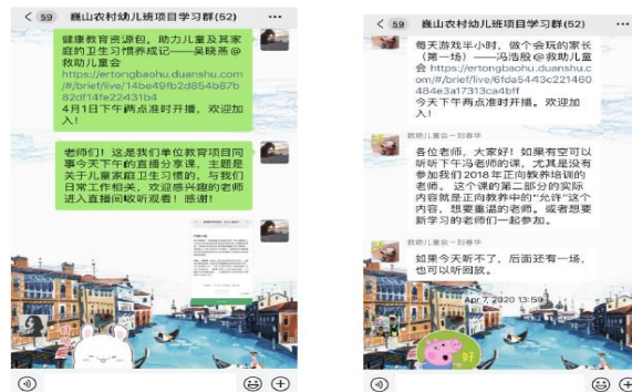
Figure 2. Learning resources shared through WeChat for teachers in the rural community kindergarten in Weishan County 9