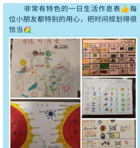
Figure 3. Parents and children created a daily timetable together based on kindergarten's recommendations