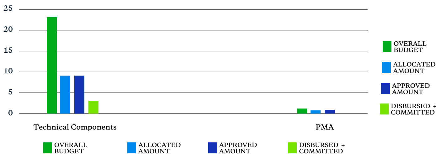
Figure B. SURGE Associated MDTFs Financial Overview