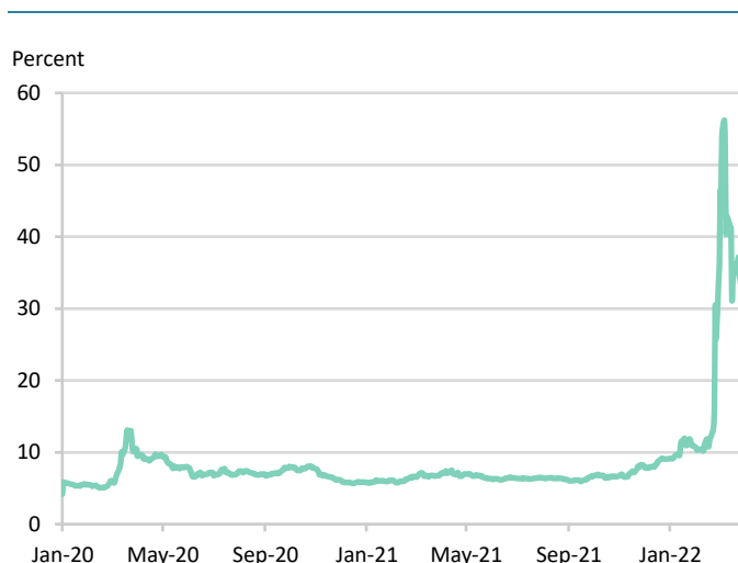
FIGURE 1 Ukraine / EMBI bond spreads

Latest data point from March 30, 2022.