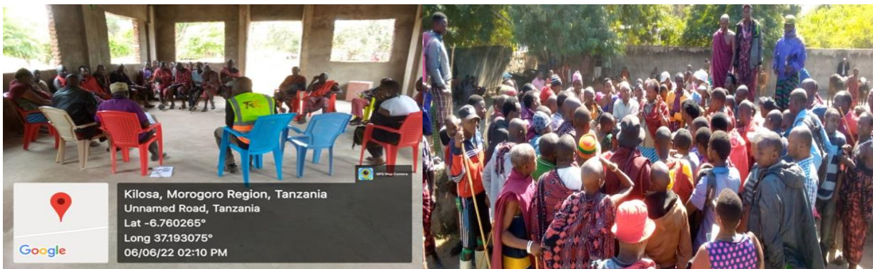
Photo 3: Public meeting with Maasai Community residing along the project corridor

Public meetings with vulnerable groups were conducted to share project information to IP groups and understand their views and concerns regarding the project. The discussed issues were related to safety, provision of crossings and inclusion of IPs in project benefits. Consultation topics, the asked questions and the responses have been presented in table 1.